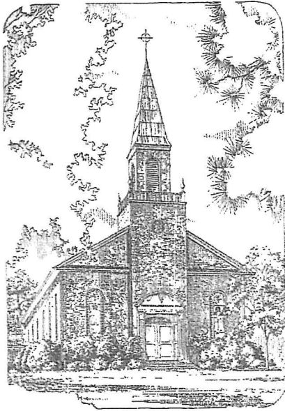
Culdee Presbyterian Church